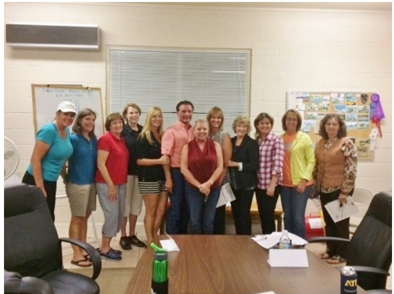
First Pinch-Hitter's Class

This has been a busy few months at the Airpark for the board of directors and the membership. It was fun seeing the ramp completely full the past few weekends. Our tie down fees and gas sales certainly benefitted.